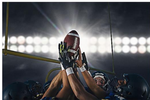
Teamwork makes the dream work!

“Volunteers do not necessarily have the time; they just have the heart.”