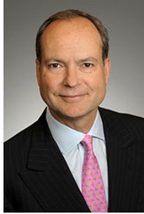
Peter Bethlenfalvy Minister of Finance

Thank you for sharing your messages to our members!