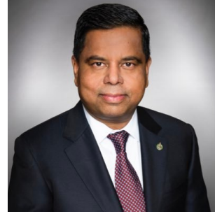
Gary Anandasangaree Member of Parliament