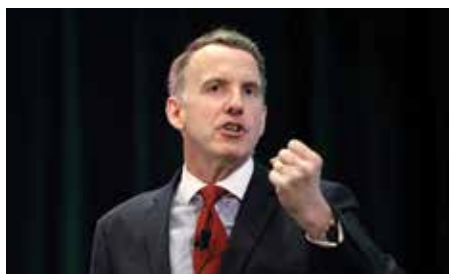
2019 BC Land Summit Keynote Speaker Edward Glaeser

After that information-packed session, delegates were provided an opportunity to network before heading out to morning sessions